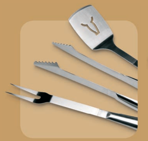
My Toolbox Mate

BeefMates Wide Spatula Product Code: 94976