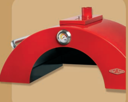
Pizza Perfection Mate BeefMates Pizza Oven Product Code: 29710

BeefMates 6 Piece Steak Knife Set Product Code: 94966