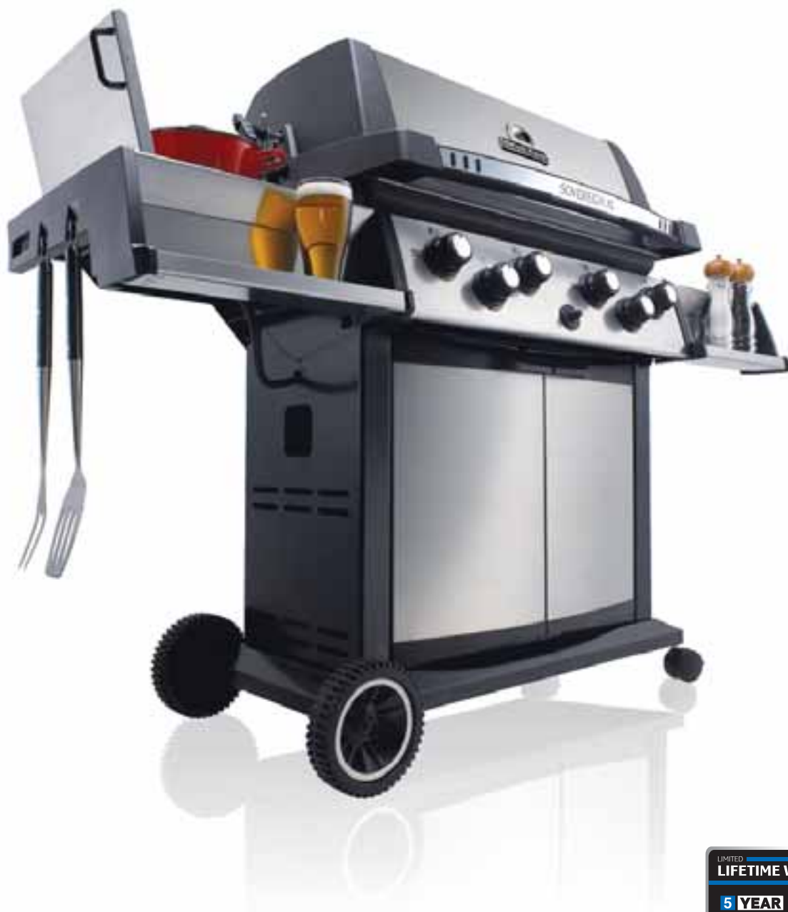
SOVEREIGN™ XLS 90

The Sovereign™ series is your complete outdoor companion for exceptional grilling. The Therma-Cast™ aluminum oven and solid stainless steel cooking grids maximize the cooking ability. The spacious storage cabinet with extra-large fold down side shelves provides room for all your condiments and utensils.