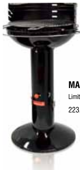
MAJOR Black Limited edition 223.5010.000