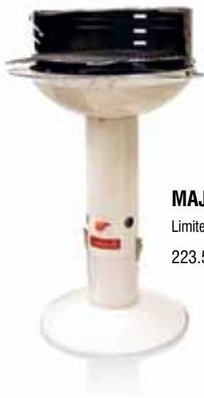
MAJOR White Limited edition 223.5011.000

Now also available in trendy white and black