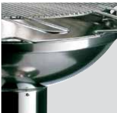
High-quality stainless steel (inox)

Enjoying a delicious barbecue without a care and in all safety . That's all possible thanks to our QuickStop® system . Water in the base of your barbecue offers extra stability during grilling, and extinguishes the glowing charcoal in case the barbecue should fall over. The practical handle will also serve as an accessory holder and will protect against the heat of the bowl. What's more, with the adjustable grid you always make the most healthy and delicious grill dishes. Position the grid a bit higher or lower and you will always get the perfect grilling result, without the risk of food ever making contact with the unhealthy flare-ups.