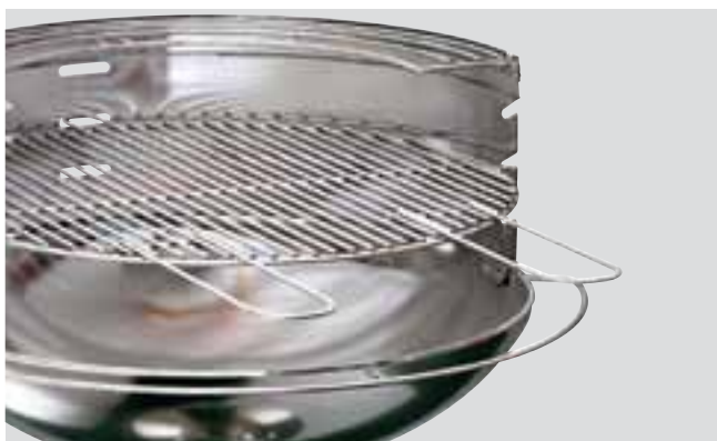
Healthy and successful baking result thanks to the adjustable grid height