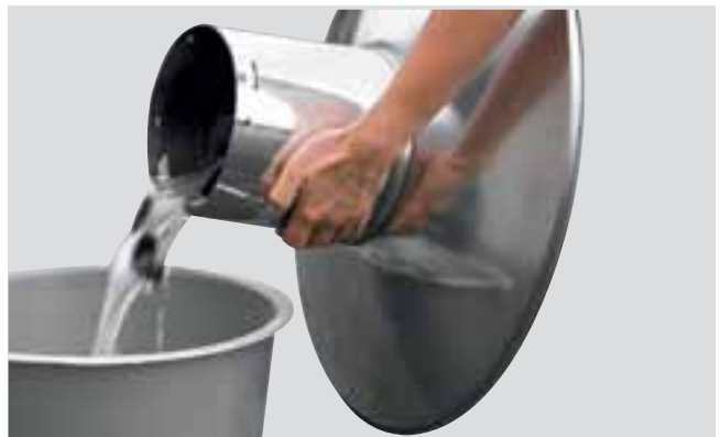
Quickly clean again with QuickStop®