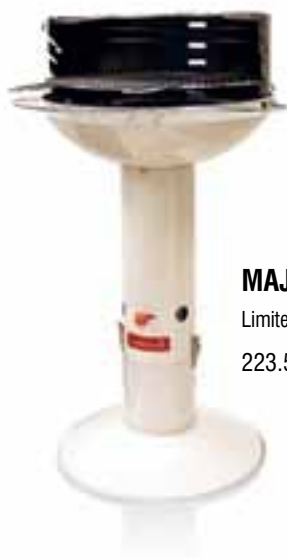
MAJOR White Limited edition 223.5011.000

Now also available in trendy white and black