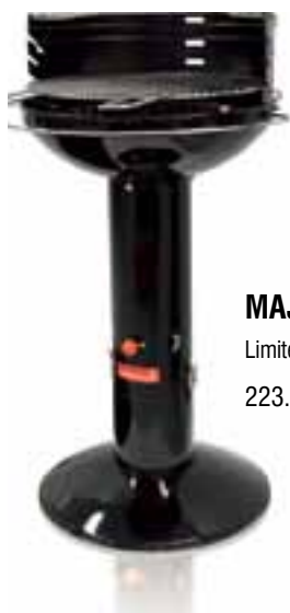
MAJOR Black Limited edition 223.5010.000