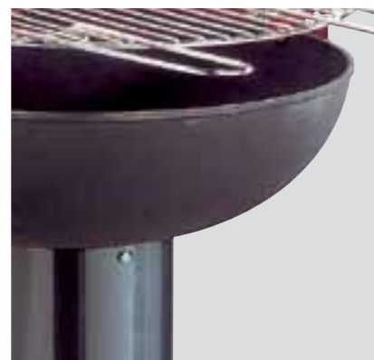
Extremely solid cast iron