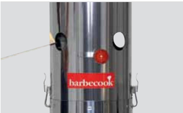
Grill-ready within 15 minutes with QuickStart®

The difference is in our eye for detail.