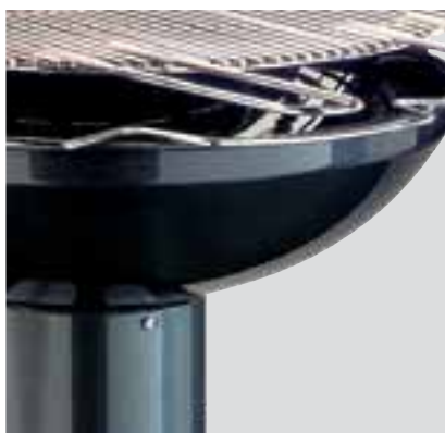
Very qualitative enamel