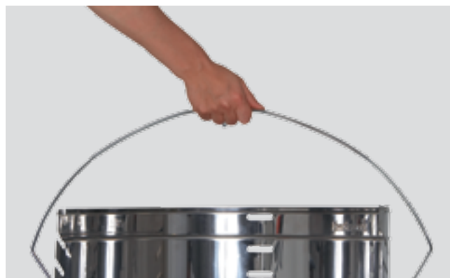
Safe, multifunctional handle