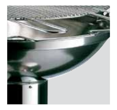
High-quality stainless steel (inox)

Enjoying a delicious barbecue without a care and in all safety . That's all possible thanks to our QuickStop® system . Water in the base of your barbecue offers extra stability during grilling, and extinguishes the glowing charcoal in case the barbecue should fall over. The practical handle will also serve as an accessory holder and will protect against the heat of the bowl. What's more, with the adjustable grid you always make the most healthy and delicious grill dishes. Position the grid a bit higher or lower and you will always get the perfect grilling result, without the risk of food ever making contact with the unhealthy flare-ups.