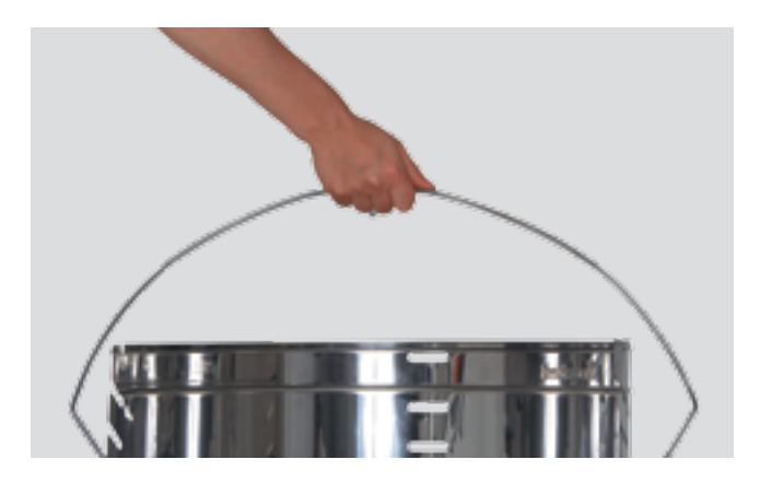
Safe, multifunctional handle