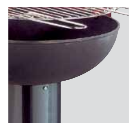
Extremely solid cast iron