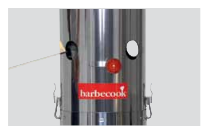
Grill-ready within 15 minutes with QuickStart®