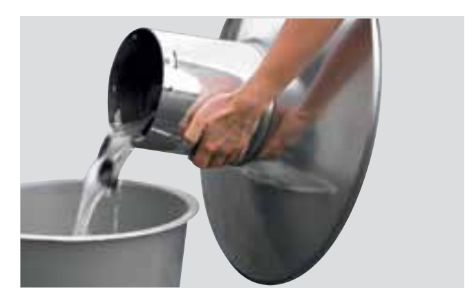
Quickly clean again with QuickStop®