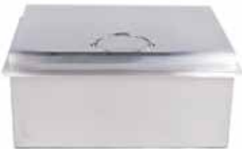
Ice chest Ref. A-IC L. 71,1 x D. 53,3 x H. 34,2 cm