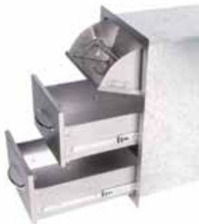
Paper towel combo Ref. A-DPCF L. 43,1 x D. 52 x H. 76,2 cm