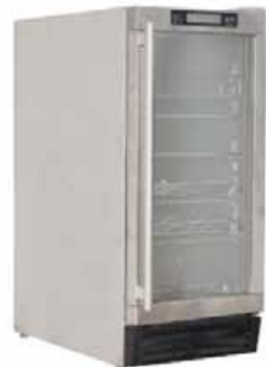
Stainless steel 90 lt. outdoor refrigerator Basket for displaying wine bottles - LCD Display 26 bottles cap. or 84 cans Ref. SC-90OD L. 37 x D. 58,5 x H. 85 cm