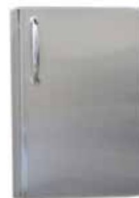
Premium door with shelf