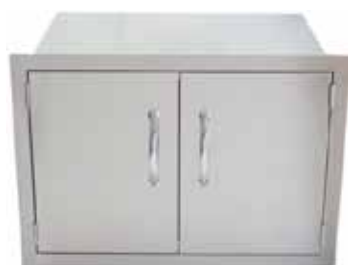
Double door dry storage

Ref. DSH1724 L. 68,5 x D. 53,3 x H. 50,8 cm