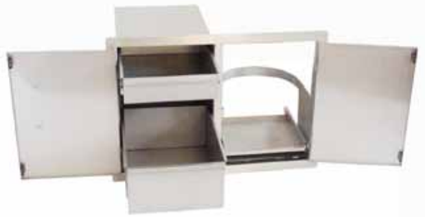
Double door & Combo Ref. A-LPDC L. 81,2 x D. 50,8 x H. 58,4 cm