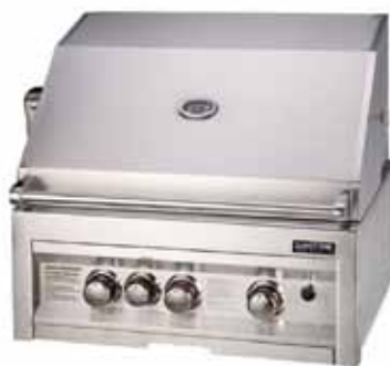
3 Burner with lights Ref. SUN4B-IR

Just close the lid and put the interior at the desired temperature..