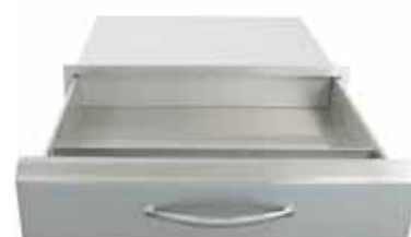
Premium simple drawer

Ref. DD30 L. 76,2 x H. 53,6 cm Ref. DD42 L. 106,6 x H. 53,6 cm