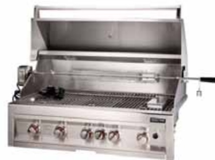
5 Burner with infrared and rotisserie Ref. SUN5B-IR