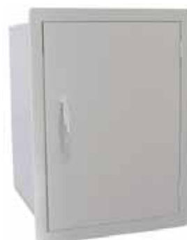
Vertical dry storage

Ref. DSH30 L. 68,5 x D. 53,3 x H. 50,8 cm