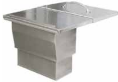
Trash Chute & Combo (Funciona em conjunto com o Art. Nº A-TRHD) Ref. A-TRCH L. 34,2 x D. 52 x H. 24,1 cm