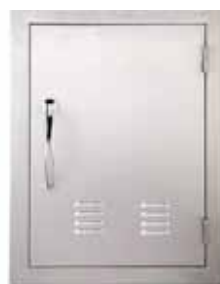
Vertical door, ventilated