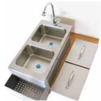
Cocktail Station - Double sink, sink covers and removable basket Ref. A-CS14 L. 35,5 x D. 77,4 x H. 27,9 cm