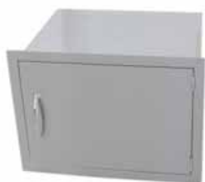
Horizontal dry storage

Ref. DSH1724 L. 68,5 x D. 53,3 x H. 50,8 cm