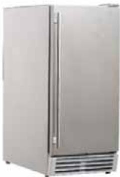
Stainless steel Ice Maker for outdoor Ice type: cube - 20Kg/day - 12Kg Deposit Ref. AZ-20D L. 37 x D. 60 x H. 84,2 cm