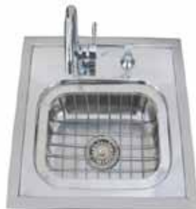
Premium sink with cover, cutting board, basket and strainer Ref. A-PS21 L. 52,7 x D. 53,3 x H. 23,4 cm