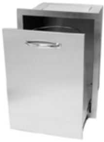
Trash drawer Ref. A-TRHD L. 50,8 x D. 40,9 x H. 68,5 cm