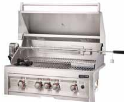
4 Burner with infrared and rotisserie Ref. SUN4B-IR