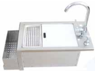
Cocktail Pro Station - Insulated for ice, large sink, cutting board, cocktail bins, bottle rail, drink tender and cover Ref. B-SC14 L. 35,5 x D. 63,5 x H. 28,5 cm