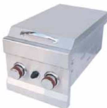
Double burner Ref. 2CSB