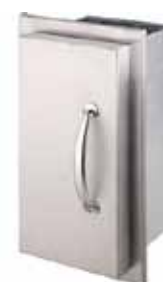
Paper towel holder

Ref. DSV2417 L. 50,8 x D. 53,3 x H. 68,5 cm