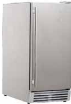
Stainless steel 90 lt. outdoor refrigerator Interior light - Adjustable temperature Ref. BC-90OD L. 37 x D. 58,5 x H. 83,6 cm