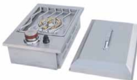
Simple burner Ref. 1SSB