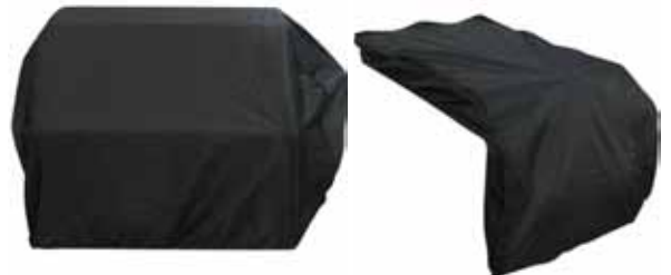
Covers for 3B, 4B, 5B and simple side burner and double side burner