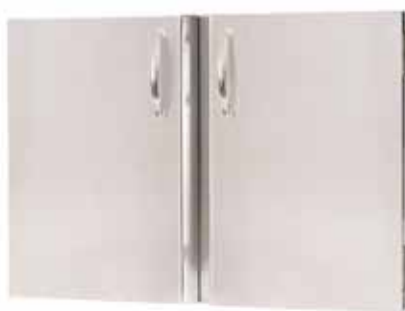
Premium com prateleira interior

Ref. A-DD30 L. 76,2 x H. 53,6 cm Ref. A-DD36 L. 91,4 x H. 53,6 cm