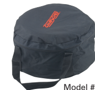
Model #: CBUNV

Camp Chef's Universal Carry Bag fits 10, 12, and 14 inch oven sizes to help you manage and protect your ovens.