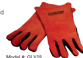
Model #: GLV15

High quality, heat resistant leather gloves. Attractive red and black styling with extra long sleeves to protect your wrists and forearms.