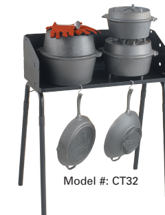
Model #: CT32