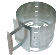
Model #: CLB9

As mentioned before the Charcoal Lighter Basket is essential if you are going to be doing your Dutch oven cooking with charcoal. The Charcoal Lighter Basket is the quickest and easiest way to get coals hot.