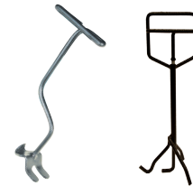
Model #: 400035

The Camp Chef Lid Lifter is the perfect aid in picking up your dutch oven lid while you cook. It lifts the lid while keeping it level. It's important to keep the lid level to avoid getting charcoal ash in the food.