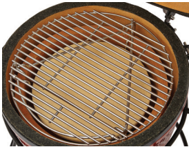
Heat Deflector and Grill Grate